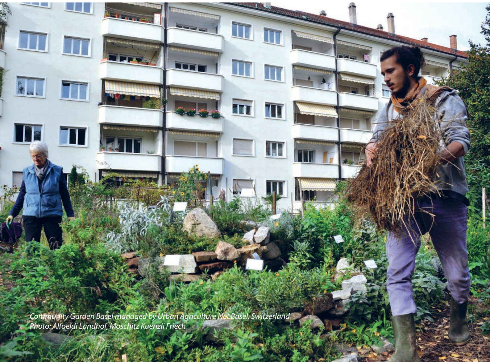
Community Garden Basel managed by Urban Agriculture Net Basel, Switzerland

The initiative Sustainable Edinburgh 2020 organized a city seminar with various stakeholder groups in December 2012. Representatives of the public sector, the private sector and the third sector/community took part. Later, a steering group comprising a wide range of stakeholders was established, with a one year work plan. The members of the steering group are: Stirfresh vegetables, Cyrenians, Iglu restaurant, National Health Service Lothian, Parks and Green Space Manager, Waitrose, SRUC, Scotland Food & Drink, Climate Challenge Fund, Social Association Scotland, City of Edinburgh Council, University of Edinburgh, Transition Edinburgh South, Nourish Scotland, Bread Matters.