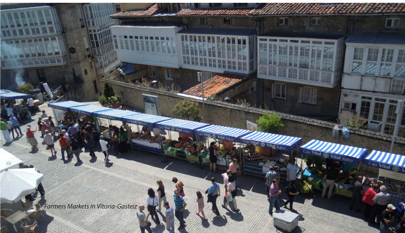
Farmers Markets in Vitoria-Gasteiz

The definition of goals ranges from more general and far-reaching to specific and detailed. A useful mnemonic to identify relevant goals is the SMART system. This is often used when setting goals and objectives, and can even be called key performance indicators. SMART stands for Specific, Measurable, Attainable, Relevant and Time-sensitive.