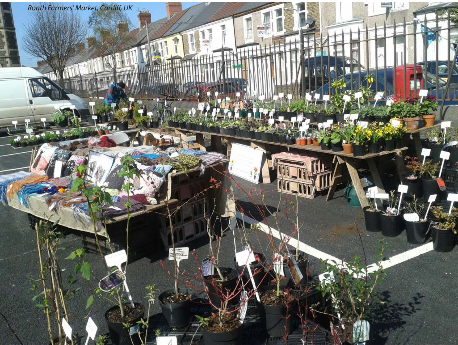
Roath Farmers' Market, Cardiff, UK

However, not only quantitative indicators on the food system are important. It is necessary to have an overarching process-oriented approach that gives value to the political spaces created and the conversations and networks generated. These elements might bring about change more slowly or in other forms but they are equally important. In this regard, a key aspect of food policy councils and similar coalitions is to influence policy; consequently this should be part of your monitoring. Finally, participation and raising awareness are also basic elements of the UFS process. Therefore, reflecting and learning on how you are promoting participation, widening the debates to the whole society, and integrating their views and needs, are crucial to the process.