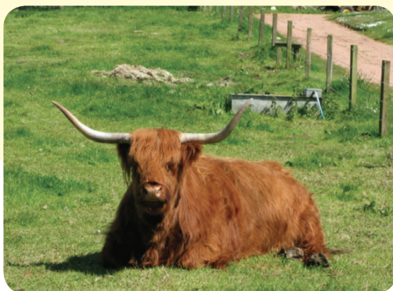
One of two highland cattle on a lifestyle farm in Scotland-Cluster: Lifestyle Farming (Image courtesy of Brian Sutherland, June 2012, Aberdeenshire)

Although the agricultural support services are orienting themselves to these new land holders by providing specialist equipment they are still largely unrecognised by policy and therefore remain un-regulated and unmonitored.