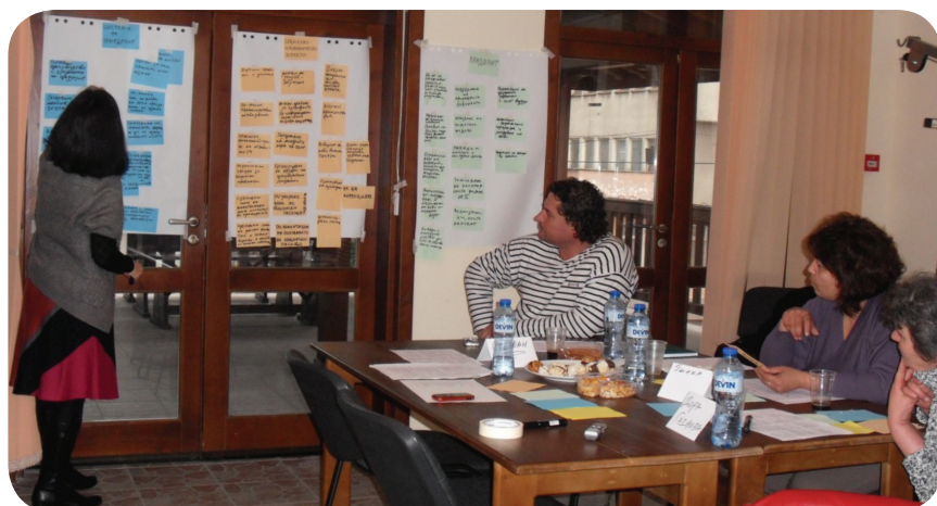
Bulgarian farmers focus group discussion (Image courtesy of Mariya Peneva, February 2013, Bratsigovo)

To learn more about this process see: http://www.farmpath.eu/Futurevisionsforagriculture