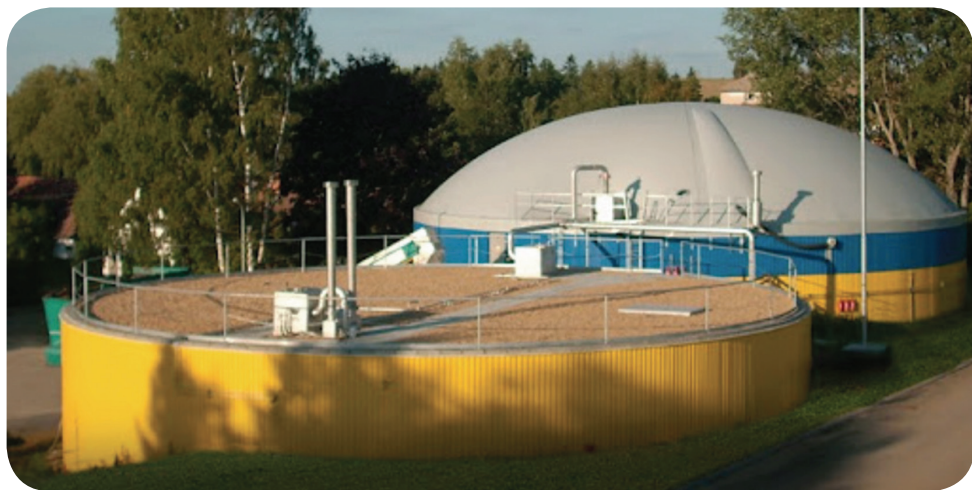
Biogas PS on the Sasov Farm, Czech Republic (Image courtesy of Sasov Farm, 2012, Czech Republic).