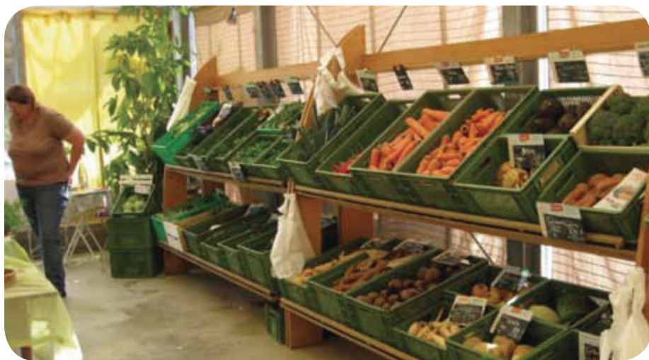
Direct marketing at RWAG partner Querbeet horticultural business, Eichstetten, Germany