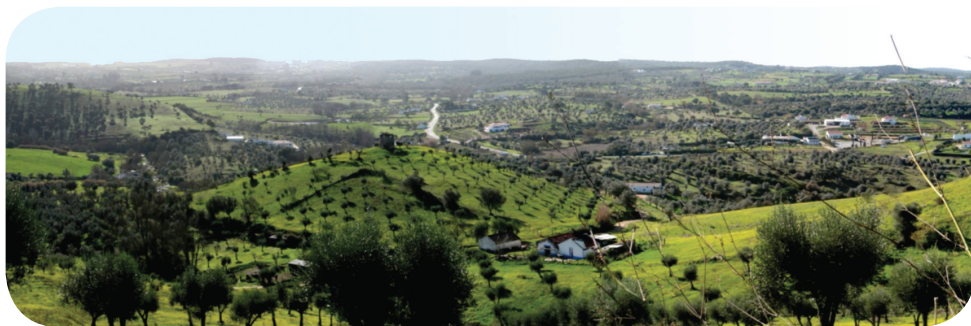
An overall view of the Paião-Reguengo landscape in Montemor-o-Novo, in the region of Alentejo, Portugal (Image courtesy of Filipe Barroso, 2012, Montemor-o-Novo).