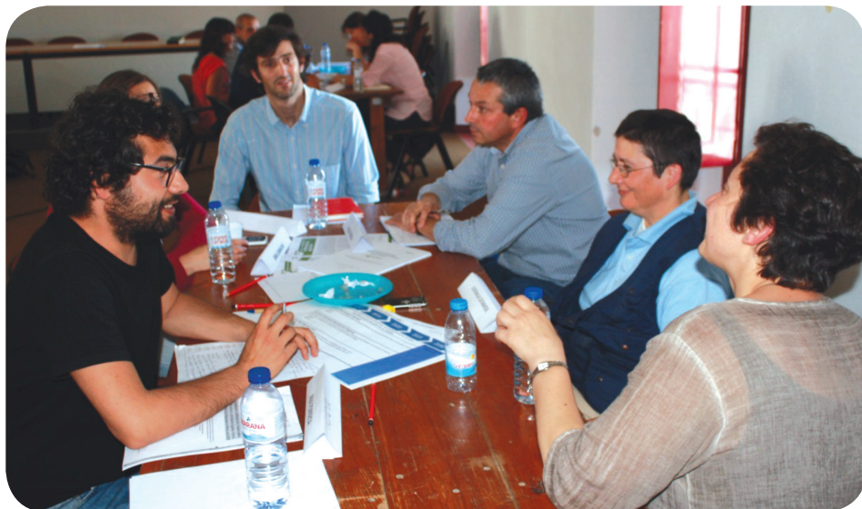
Final Portuguese pathways workshop (Image courtesy of Anne Poininet de Sivry, May 2013, Montemor-o-Novo).

If you wish to know more about this project, its theoretical background, concrete case studies or research approaches you can use our website and/or contact the project coordinator or the national teams (see p. 59).