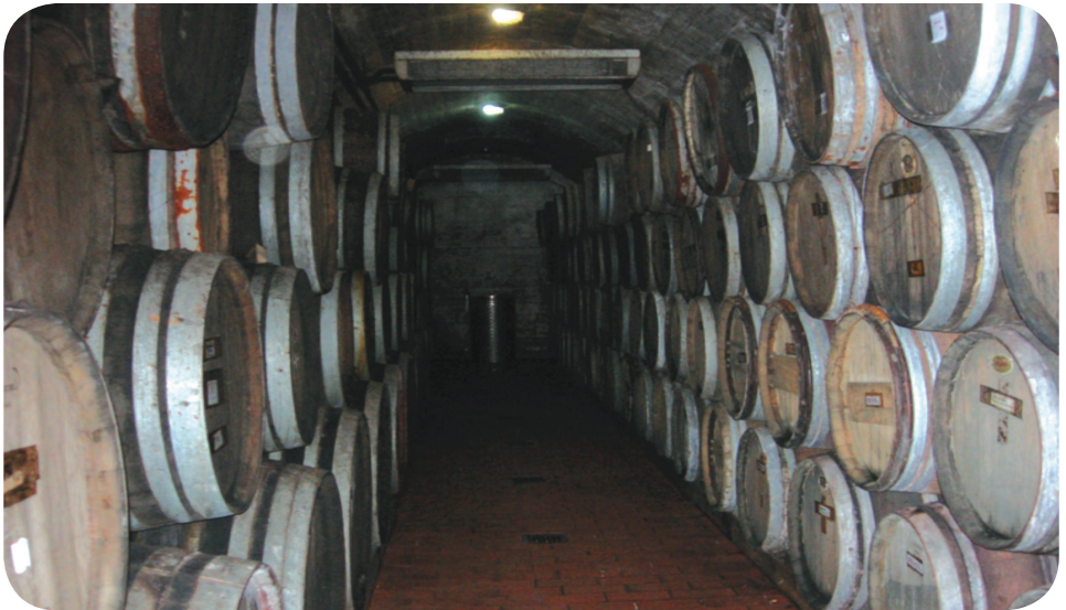
Tourists in Santorini can visit a winery and see a traditional 'kanava'- a cave dug in the volcanic soil, which houses a wine cellar