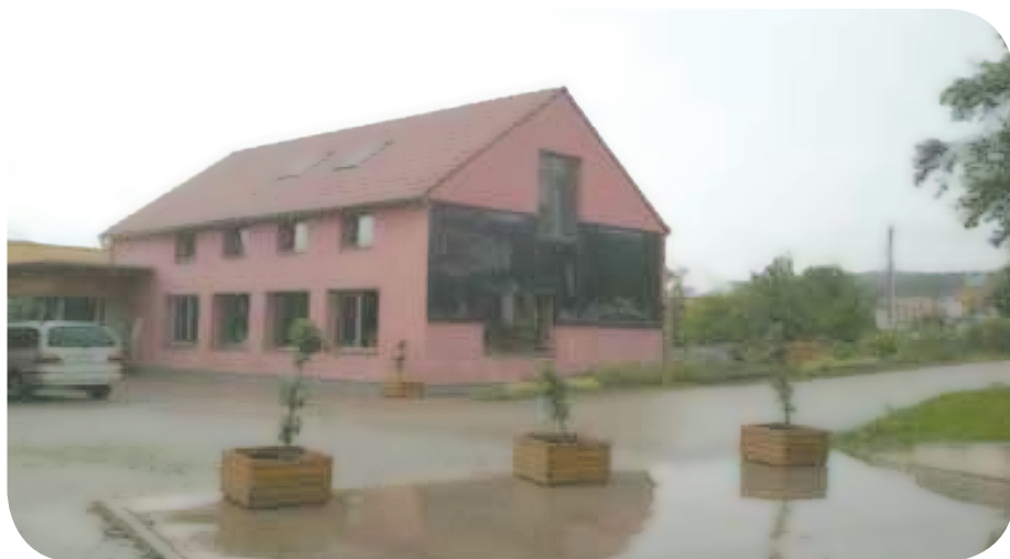
Low energy consumption community house in Hostětín, headquarters of the Czech initiative – the first low energy community house in the Czech Republic

These recommendations can be linked to those in 'Economic viability of farming activities' on p. 21, 'Going local' on p. 34 and in 'Integrated actors and strategies' on p. 38.