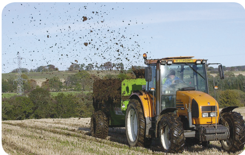
Tractor in a field, Invergowrie (Image courtesy of David Riley, October 2002, Scotland)

These recommendations can be linked to those in ‘Interconnection between farming, policy and research’ on p. 17, and in ‘Farming infrastructures and services’ on p. 25.