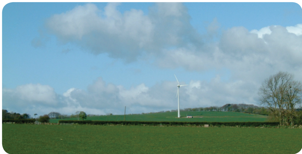
Wind turbine on a farm in Aberdeenshire (Image courtesy of Lee-Ann Sutherland, February 2012, Aberdeenshire).