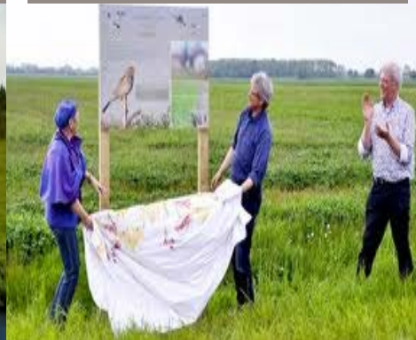
Birds, biodiversity East Groningen