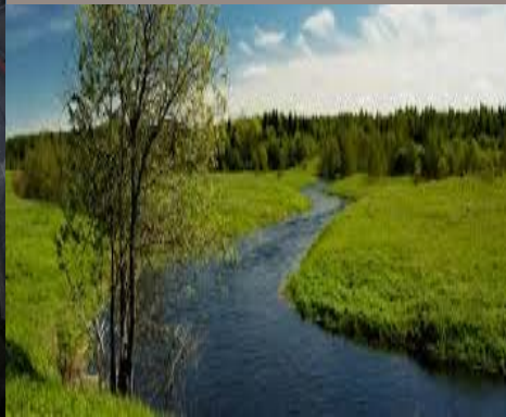
Trame verte et bleue Champagne-Ardenne